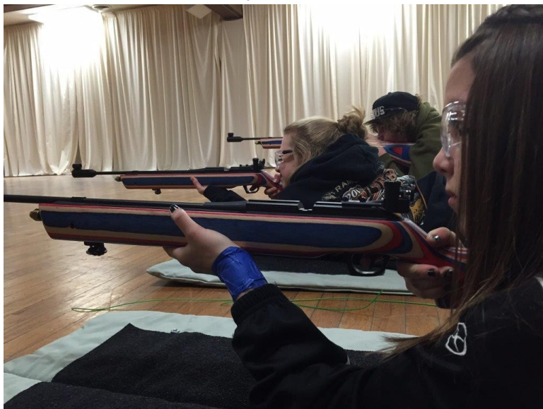
The Sotoyome Shooting Sport has been a great addition to the Sotoyome American Legion Family.