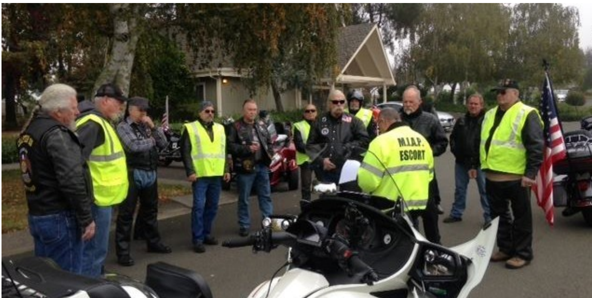
MIAP briefing at Pleasant Hills Memorial Park in Sebastopol, October 12th Chapter 111 American Legion Riders & PGR

This week’s event marks the 10 th anniversary of the cemetery’s Fallen Memorial Program. More than 27,000 veterans are now buried there.