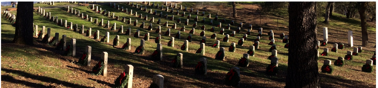
Yountville Veterans Home Cemetery