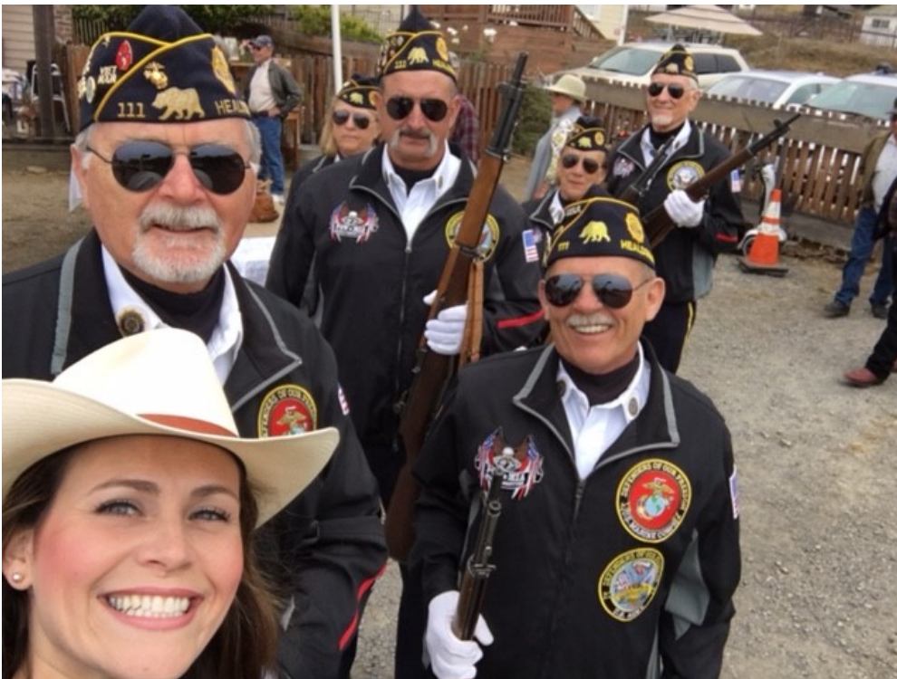
Honors Team at Stewards Point

Non-Profit Organization U.S. Postage Paid Permit No. 104 Healdsburg, Calif.