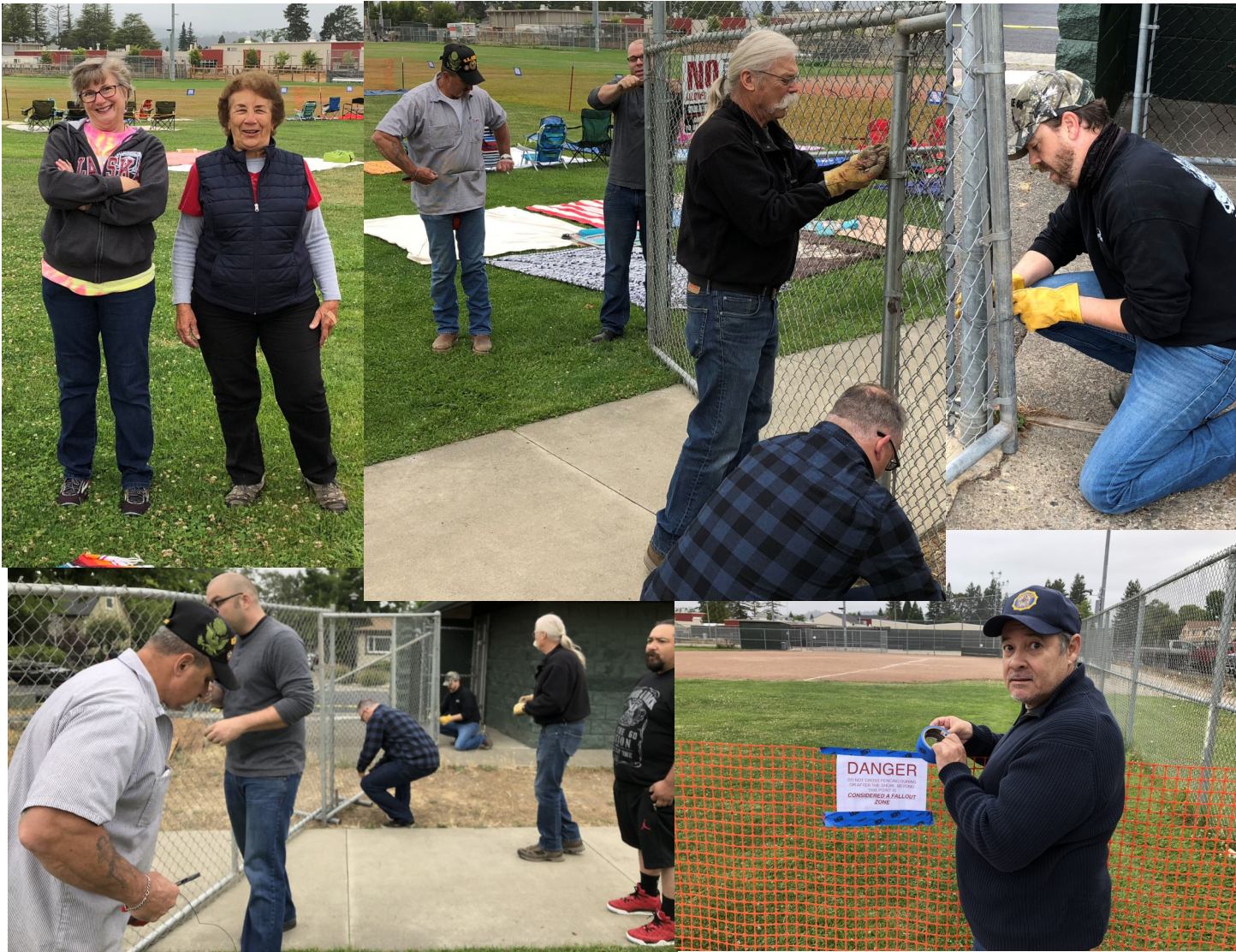
Set-up crew on July 4th