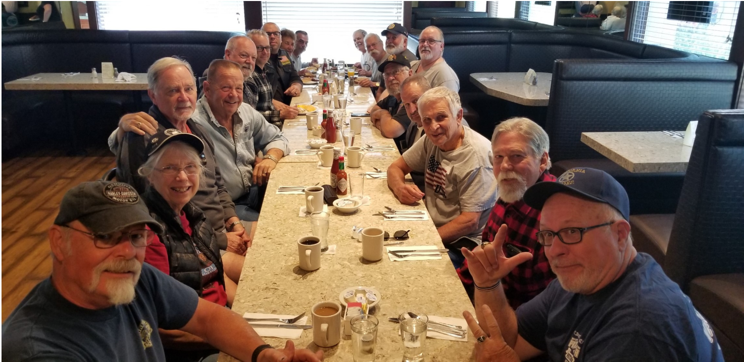
Set-up crew on July 3rd