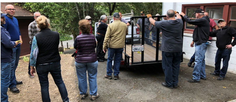
Morning of July 5th: Putting barriers back into storage