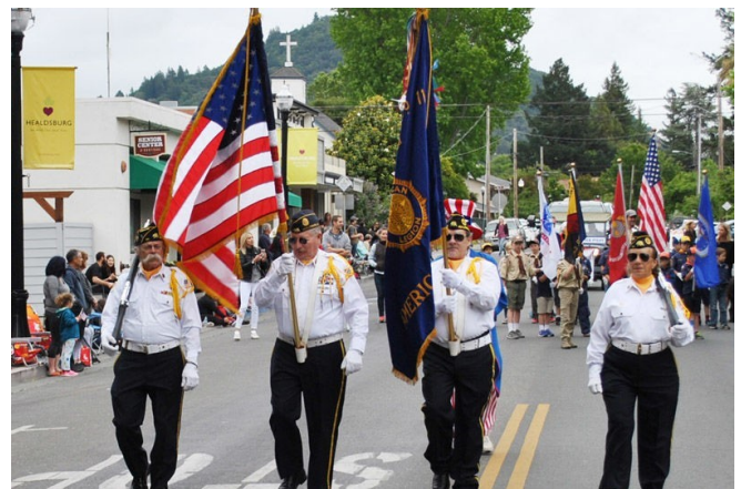
Healdsburg FFA Parade May 24th