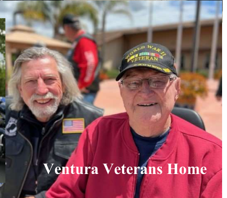
Ventura Veterans Home