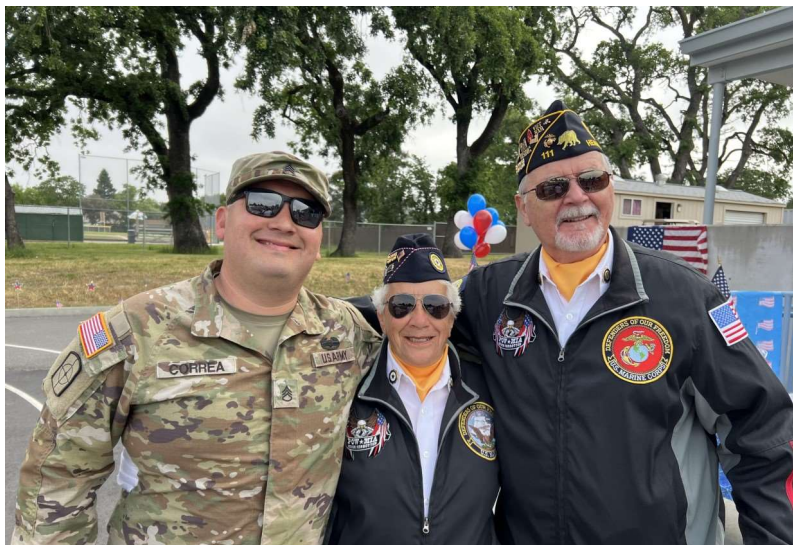
Mattie Washburn School Assembly