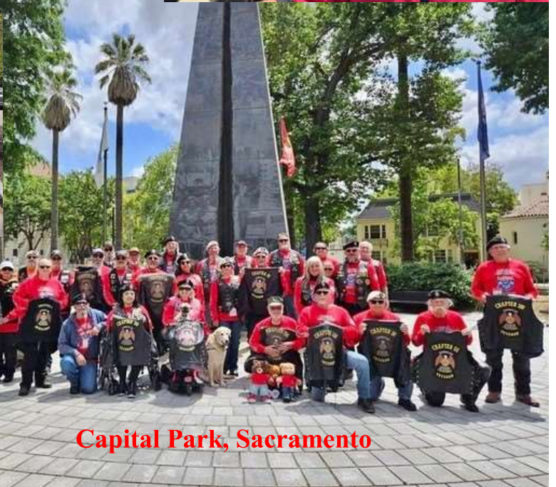
Capital Park, Sacramento