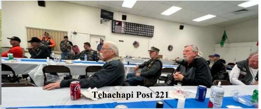
Tehachapi Post 221