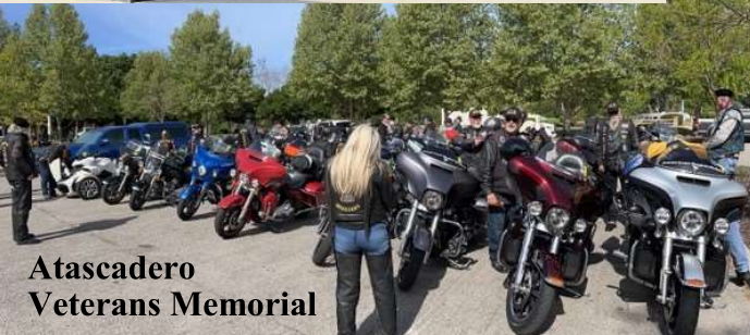
Atascadero Veterans Memorial