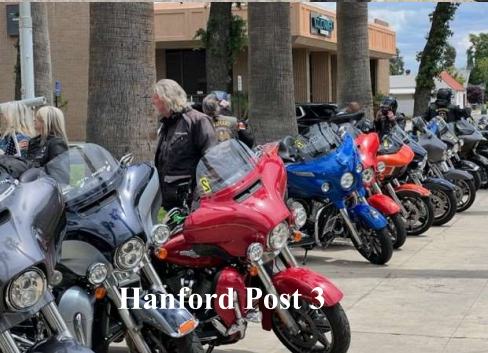
Hanford Post 3