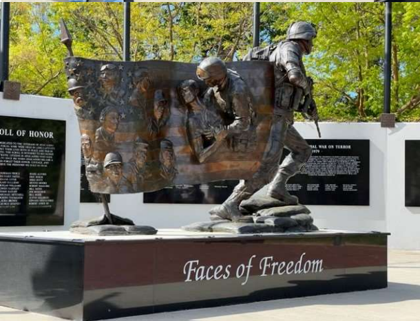
Faces of Freedom