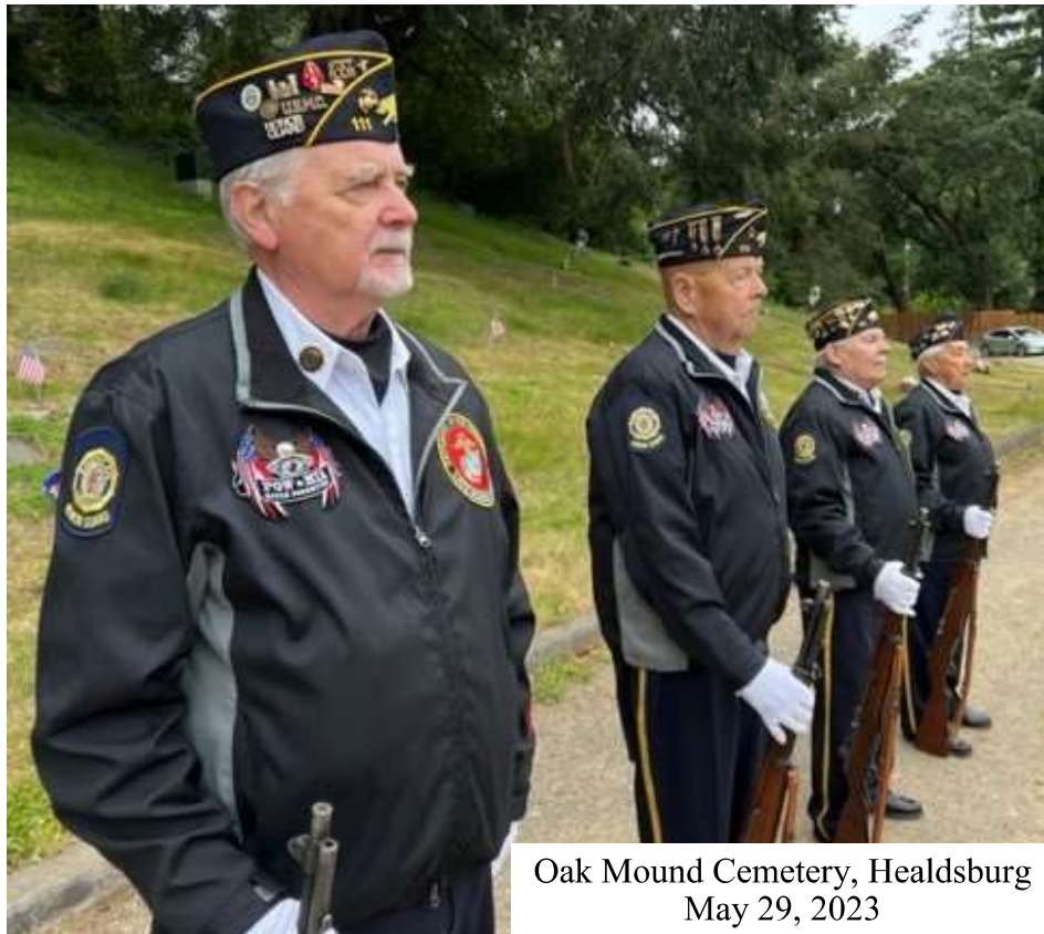
Oak Mound Cemetery, Healdsburg May 29, 2023